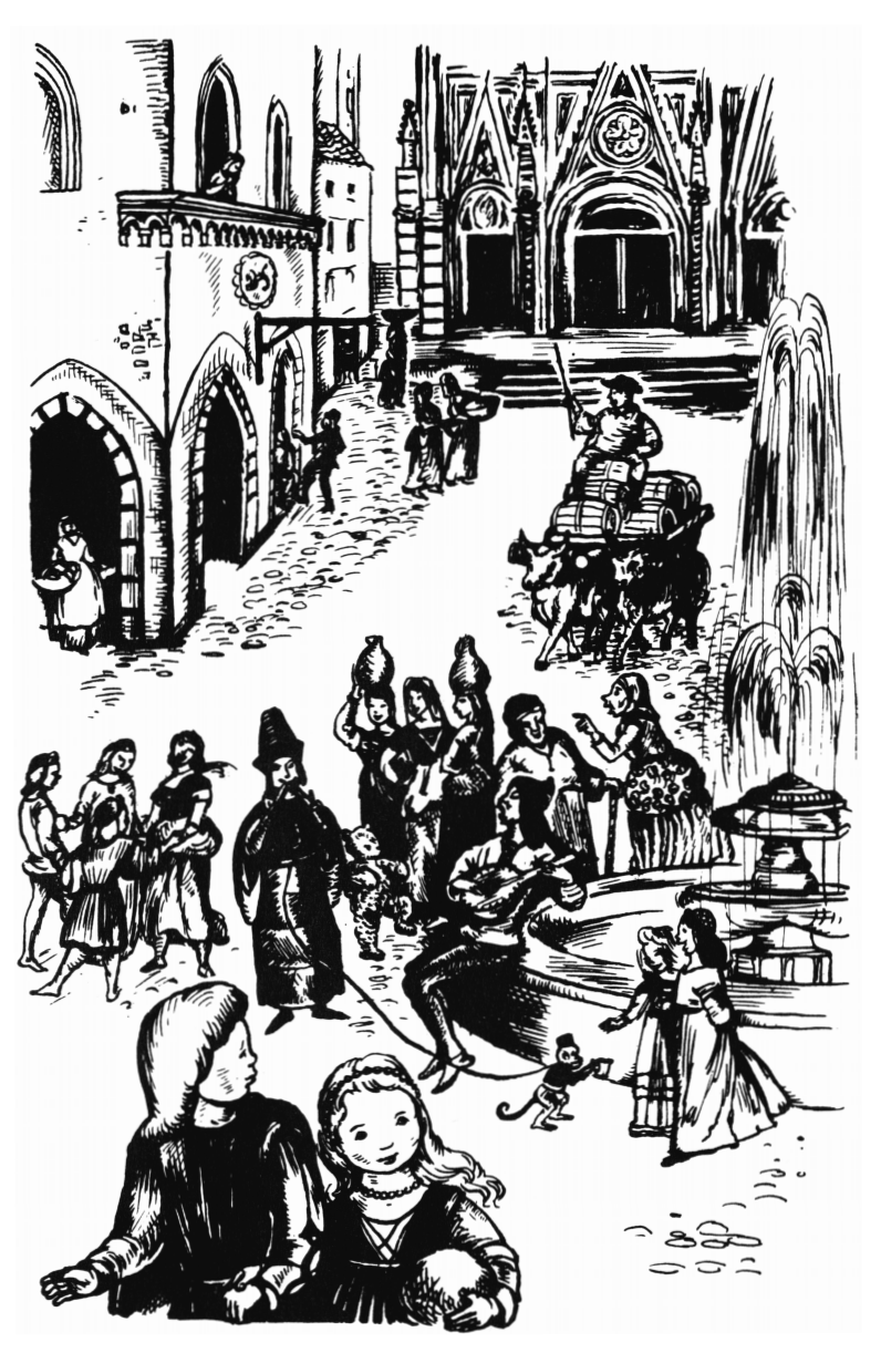
"NO, WE MUST GO STRAIGHT TO BONAVENTURA'S."