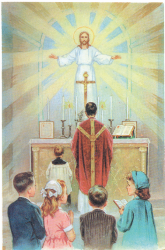
At Mass Jesus Comes to Save Us