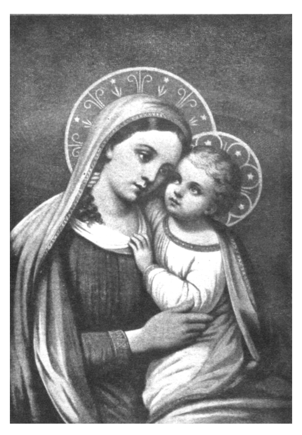
Holy Mary, Mother of God, pray for us!