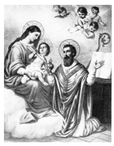
St. Augustine with Our Lady and the Christ Child.