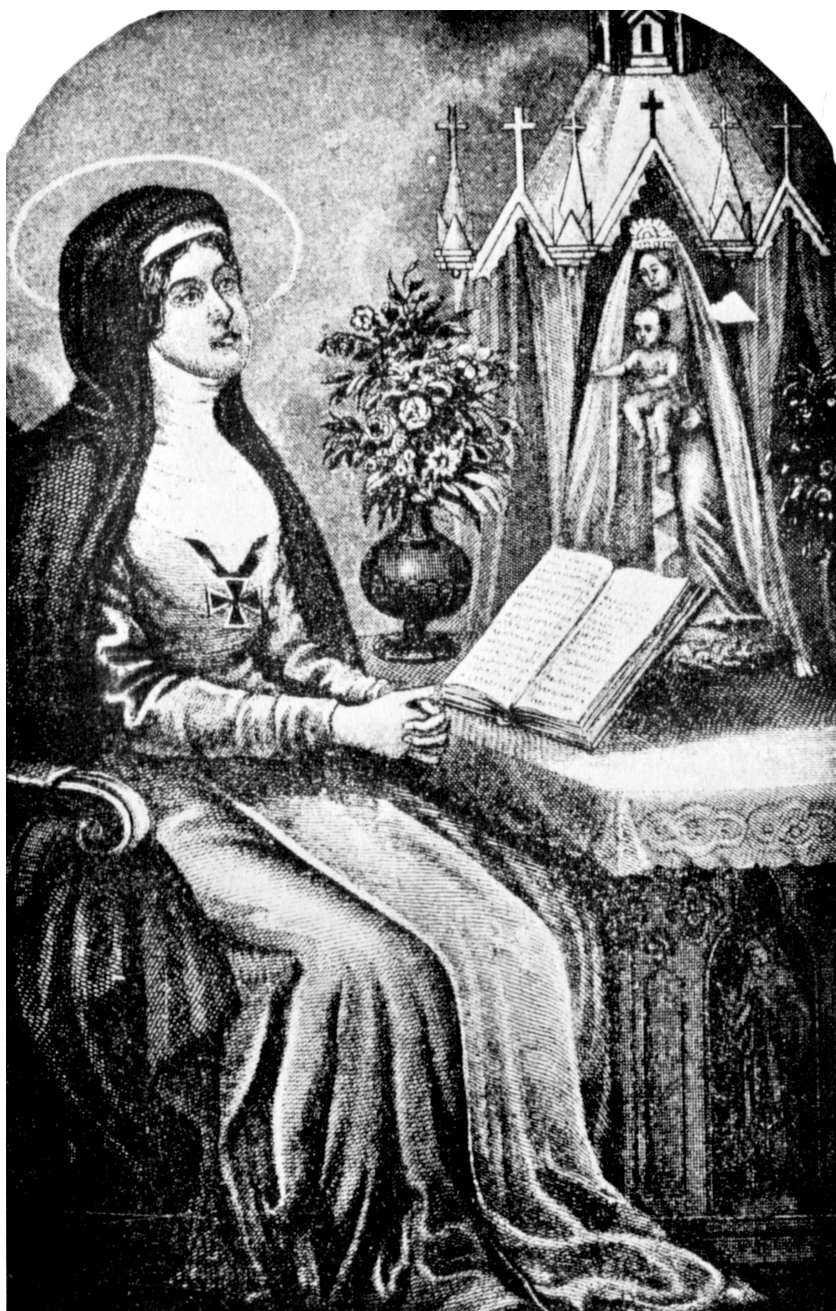
St. Bridget of Sweden (1302-1373)