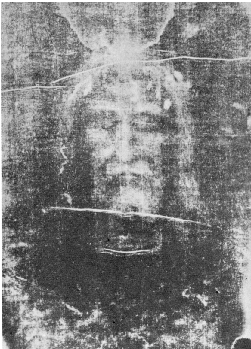
The Image of the Holy Face of Jesus Taken from the Shroud of Turin